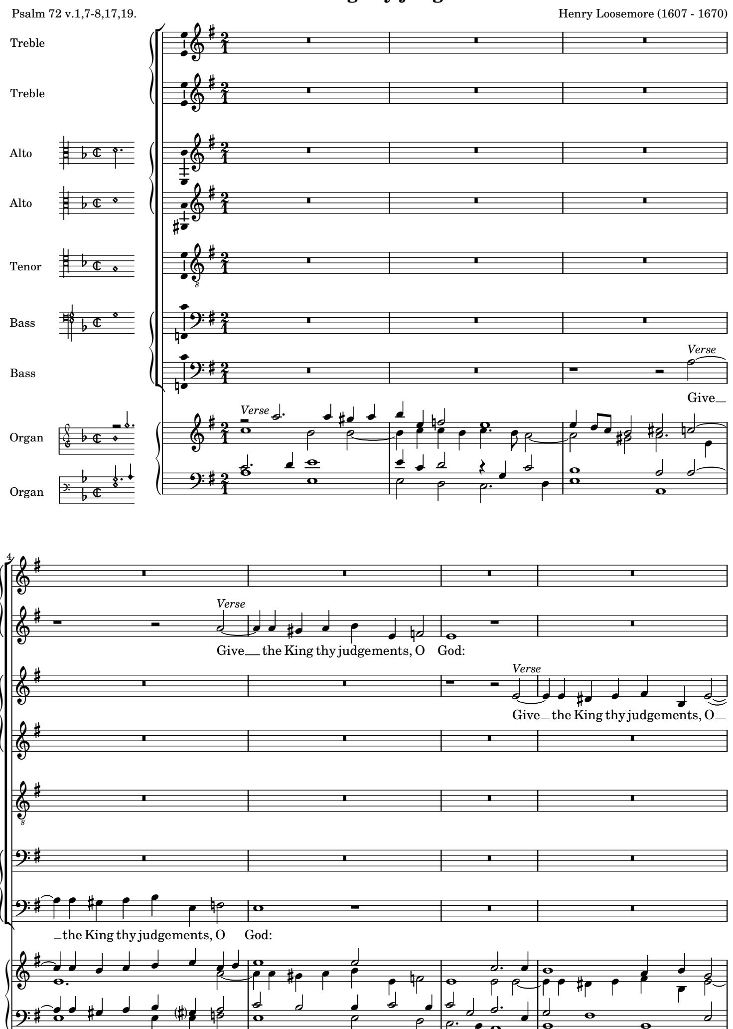
Type set\ and\ reconstructed\ 2023\ by\ Hugo\ Janacek\ from\ manuscripts\ held\ at\ Durham\ Cathedral.