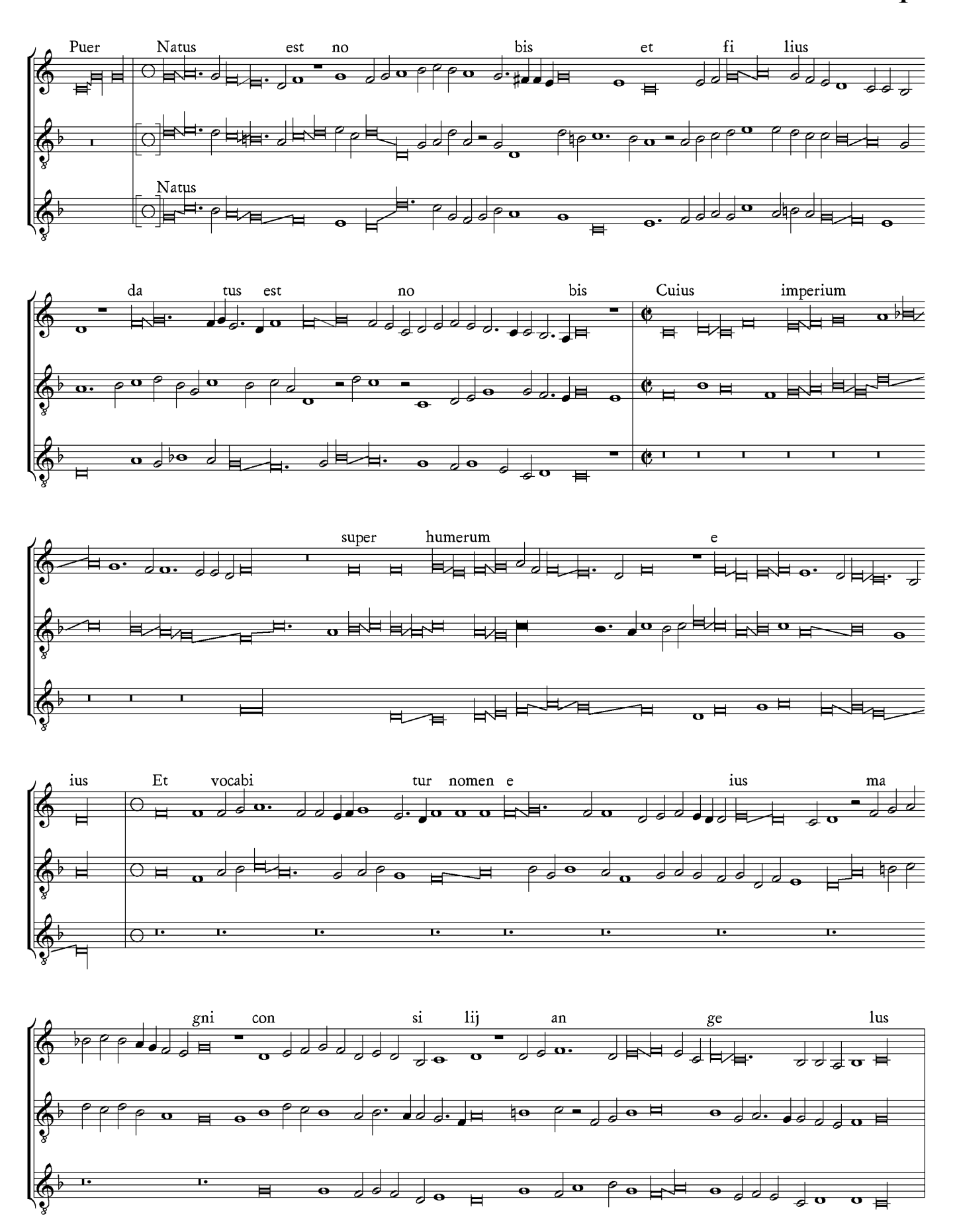
Anonymous – Trento - tr92 2v-3r