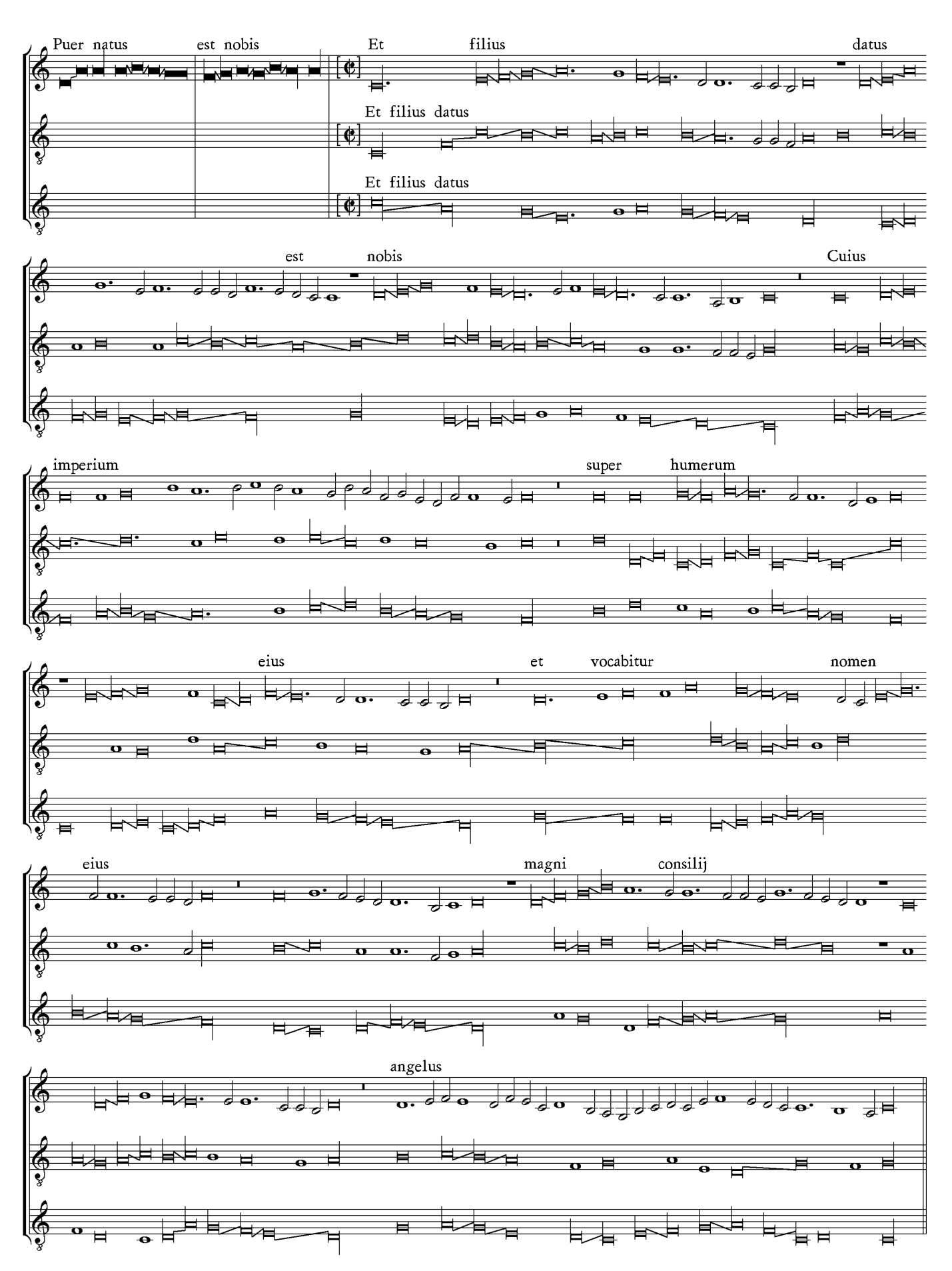
Anonymous – Trento - tr93 14v-15r